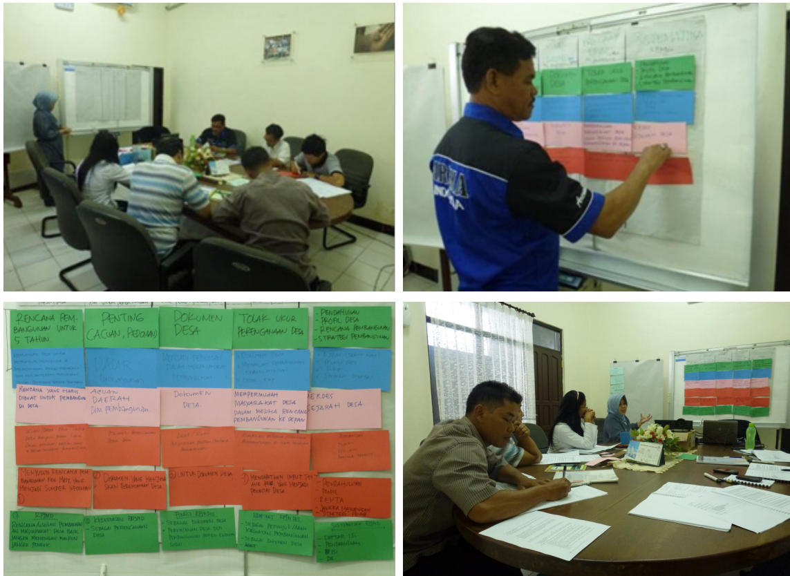
Fig. 4, 5,6. Brainstorming session of making definitions, position, and function of RPJMDes

Elsi: Why RPJMDes is not considered as input?