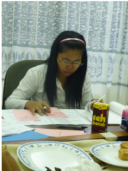
Pic. 8, 9. POs are doing review of RPJMDes and CLAP Data