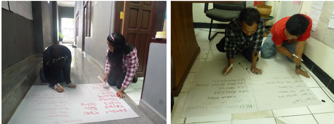
Pic. 22, 23. Ice breaking session