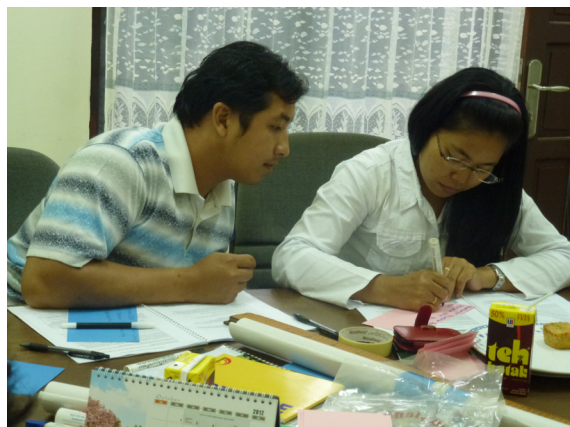
Pic. 12, 13. POs are formulating vision and mission statement in pairs