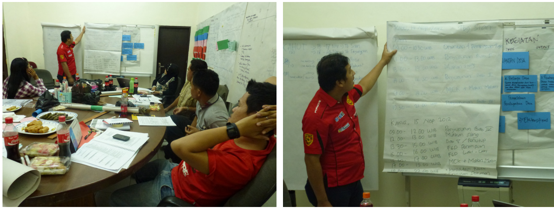
Pic. 26, 27 . Hendra is presenting their action plan for RPJMDes making assistance