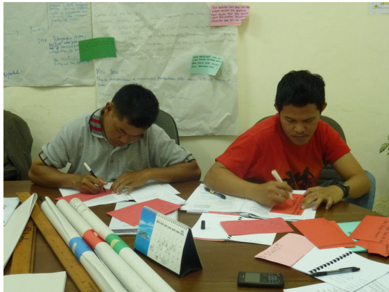
Pic. 14,15. POs are doing SWOT analysis for Mission Statement