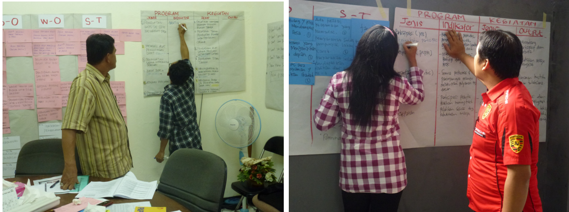
Pic. 24, 25. POs are deciding programs and activities for village

During the process of developing programs and activities, Bu Dian assisted each group to make sure each group understand how to develop it well and its basic concept and principles (simulation while assisting the group). Each of group work result was evaluated carefully by bu Dian to make sure POs and PSO understand what they put in the program and activities.