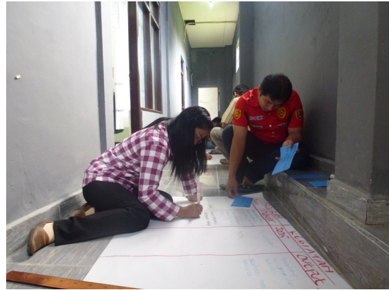
Pic 18, 19, 20, 21. Session of analysis on developing RPJMDes strategies