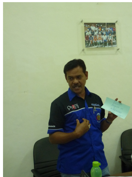
Pic 2,3,. Introduction session