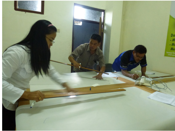
Pic. 10, 11 POs are making the format agenda for RPJMdes making assistance

The biggest challenge is doing negotiation with community for formulating the vision because the vision must state dream of the whole village citizen.