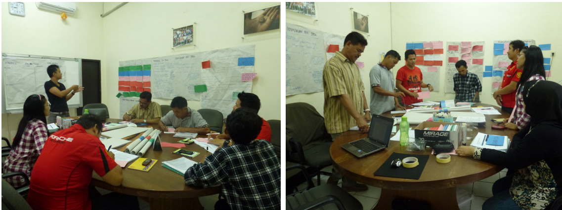
Pic. 16, 17. Review Session

Each participant has to explain the topic they got to the audience and so until each participant got they turn to speak.